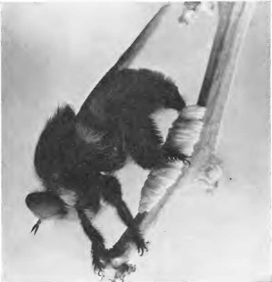
FIG. 3. A female Mallophora faultrix in the act of producing an egg case. Note that the case is constructed of thin coils of white oothecal material.

Flight activity.—The period of considerable flight activity coincided closely with the time when the fly's abundant model, B. sonorus , was also active in the area (Fig. 2). Whether the synchronous flight periods reflect a common thermal constraint on energetic flight for both species or whether selection has favored flies which time their conspicuous aerial reproductive activities to match the flight period of the model could not be determined. Perhaps both factors are responsible for the daily pattern of activity of M. faultrix .